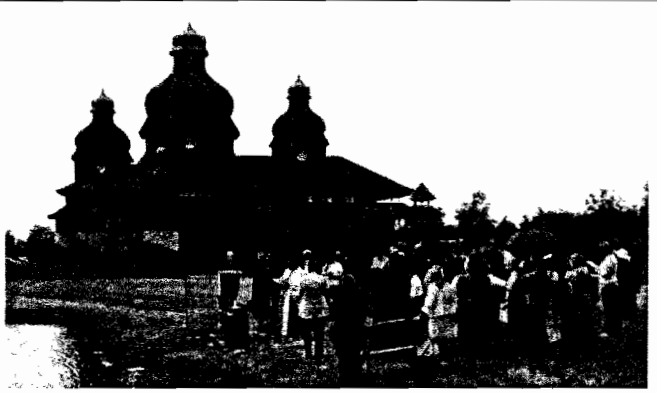
The faithful have assembled