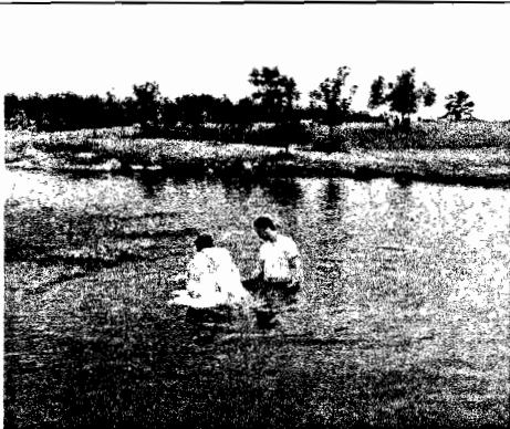
... in the Name of the Father ! and of the Son!...and the Holy Spirit!